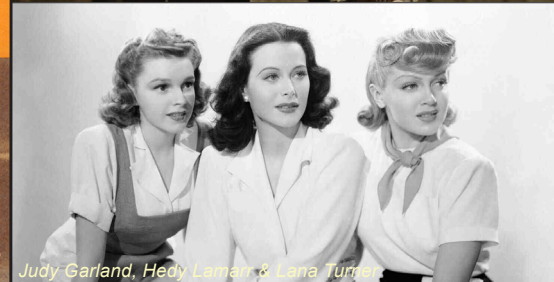
Judy Garland, Hedy Lamarr & Lana Turner

FABULOUS lives of the beauties who made the words Ziegfeld Girl synonymous two decades ago with what we now call glamour, are depicted in a lavish drama with music being made by M-G-M. It's an authentic backstage story of joys and sorrows, beauty brought into the limelight, the Folies. Judy gets glamour for her role of a vaudeville performer who leaves all with her dad, Charles Winninger, for the glory of being a Ziegfeld Girl, and makes good, temptations of one kind or another cut short careers of Hedy and Lana, but Judy goes on to become a great star of the Folies.