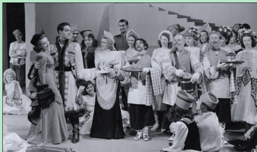
Above: Marta Eggerth, Judy Garland & Cast

Finale (Film Version) * (Judy Garland, Charles Walters & The MGM Studio Chorus) (6:28)