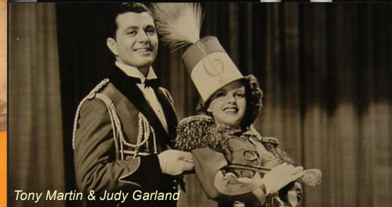
Tony Martin & Judy Garland